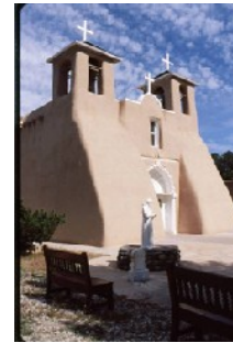
Quietude by Jim Stewart (slide)

Assigned Subject for the November competition will be Architecture The subject matter would be the outside of buildings only Assigned subject means that ALL entries must be of the subject specified.