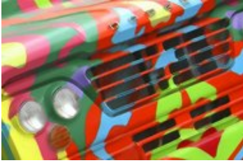
Woodstock by Andi Sahlen (color print)