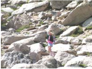
Pink Cowboy Boots By Ellen Westbrook (print)

We also decided that we will not have a December meeting due to the holidays.