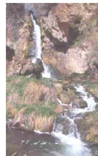
Mighty Cascade By Jim Stewart (slide)

There was no club competition in September due to Aurora hosting the quarterly Council competition.