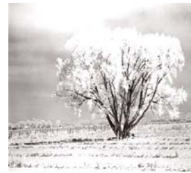
Frost Foliage, Alamosa by Fred Crowle

On a sad note, due to budget constraints Aurora is facing the closure of the History Museum & several recreational pools and laying off 21 city employees. If voters pass a 4 mill levy property tax all could be saved. As a Fitzsimons pool user and History Museum volunteer I urge you to vote for art and culture. Aurora is the third largest city in Colorado and can't keep up with Leadville or Louisville which have historical societies and museums. In the meantime vote and keep those shutters clicking.