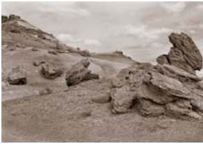
Rock Garden, Cain Wash Utah By Fred Crowle (B/W print)