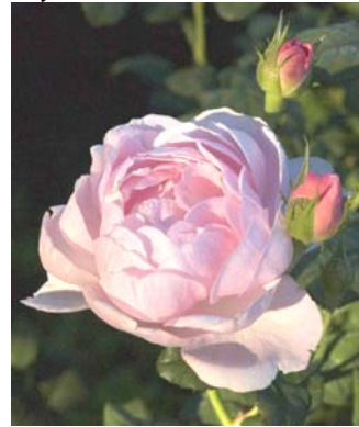
Pink rose and Water Drops