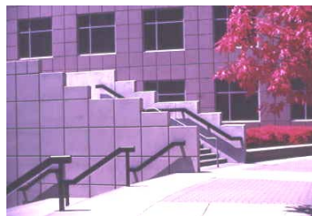
False Steps (color infrared)