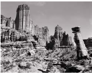
Pulpit Rock, Fisher Towers By Fred Crowle