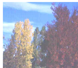
Contrast in Color by Marty Golden