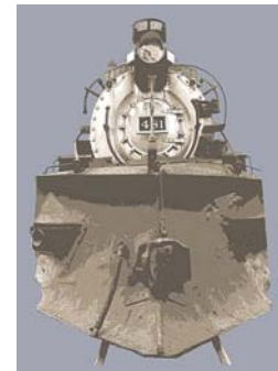
Snow Plow Engine Cumbres-Toltec Line

I invite you to send me any articles that might be of interest to our members. I also would like images. Scan, title and send to me at ( Broncoloulane@aol.com )