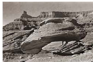
.Shafer Rocks Canyonlands by Fred Crowle

July 4 th Field Trip to the Four Mile Park on south Forest just off Leetsdale . It opens at 10 am so we can meet at the entrance between 10 am and 10:15 am. Let me know if you plan to attend so we can look for you. 303 751 –2097 or broncoloulane@comcast.net