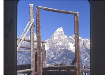
Teton Framed