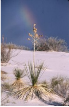
Yucca and Rainbow