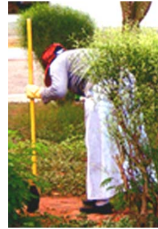
Sweeping the Walk By Andi Sahlen (color print)

shoot ( after hours) in the fall. The Council trip to Burlington to photograph the carousel is being planned for the last weekend in Aug. Details later.