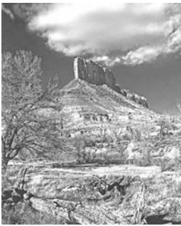
Thumbnail Hoodoo, Utah By Fred Crowle (b/w print)