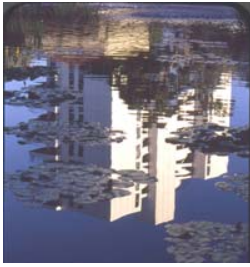
Water Image By Orland Johnson (slide)