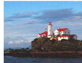
Light house Prince Rupert, Canada By Barbara Kennedy (print)

The Council will continue to have quarterly competitions in 2009 ( a three to two vote).