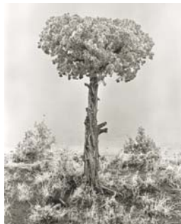
Frosted Juniper by Fred Crowle