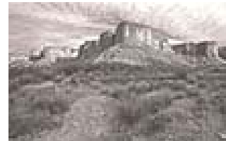
Green River Canyon Bluffs By Fred Crowle (b/w print)