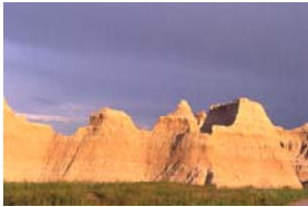
Stormy Twilight in the Badlands.