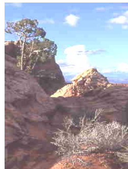
Rocks and Trees

There was no competition meeting in July.