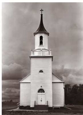
White Church, Montana

In the meantime keep those shutters clicking.